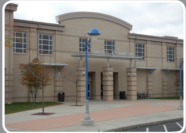
Canton City Schools • Canton, OH

Canton City Schools decided to partner with Gardiner to integrate 22 of their buildings over to an enterprise level system platform. This decision was based on the business relationship they had and the user friendly format of their existing Trane Tracer Summit controls system. First, Gardiner re-commissioned all of the district's existing Trane equipment and identified and fixed any mechanical issues that needed attention. Next, the equipment and controls were adjusted for efficiency. Finally, all of the equipment, lighting and controls were integrated over to a Niagara AX framework enterprise level system platform and graphics were generated for the operator workstation. The graphics gave all three controls systems in all of the buildings a consistent look and feel.