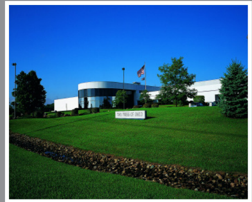
The Press of Ohio Brimfield, OH