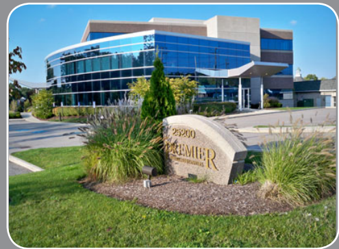
Premier Physicians • Westlake, OH

Gardiner designed a Shared Savings Agreement for Premier Physicians, which allowed Gardiner to make improvements and modifications to the HVAC equipment, lighting operation and electrical rate negotiation with no upfront cost to the client. The savings that would be generated by the improvements and modifications would be shared between Premier and Gardiner.