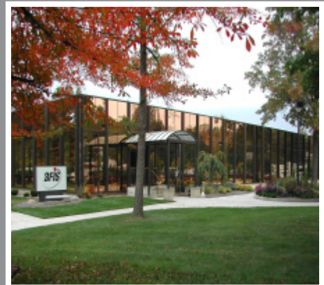
Bridgestone/Firestone • Akron, OH

The project team carefully considered orchestrating a smooth removal and installation of the cooling tower to enable quick start-up and ensure ease of service in the future.